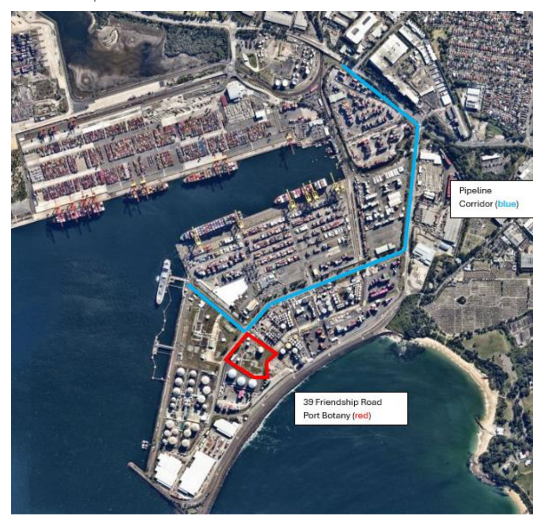
Diagram 1 - Location Map

Concurrently, we recognise we have a responsibility to enact sustainable environmental, social and governance measures which minimise the impact our business has on the natural environment and the communities in which we operate. As part of this Expression of Interest ( EOI ), process for 39 Friendship Road, Port Botany, NSW Ports is looking for the right tenant (preferably a bulk liquids operator) to deliver sustainable trade growth that supports our business objectives and meets the needs of the people and businesses of NSW. Further details regarding NSW Ports Strategic Approach are available here.