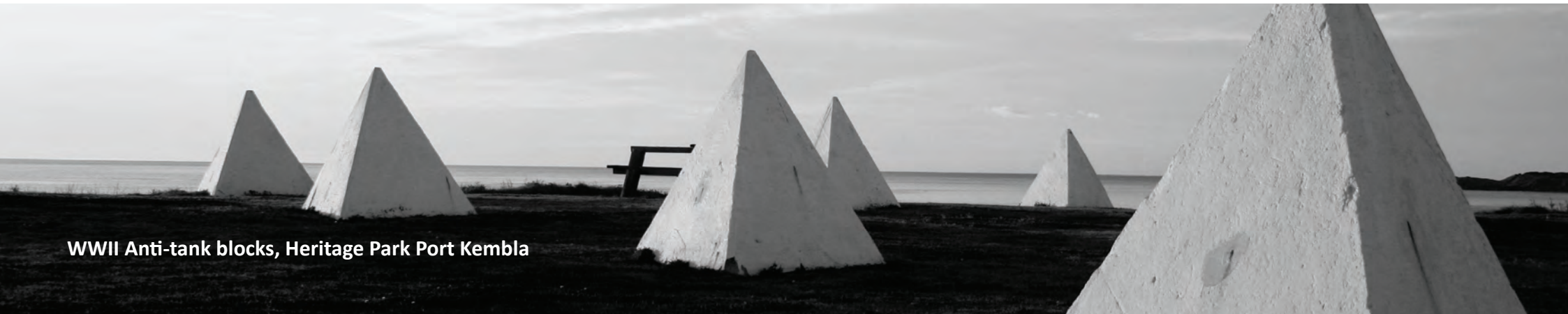
WWII Anti-tank blocks, Heritage Park Port Kembla

The Owen gun used primarily by Australian troops proved to be very reliable and was so popular it became known as the 'Diggers Darling'. A total of 45,479 Owen guns were produced at Lysaghts.